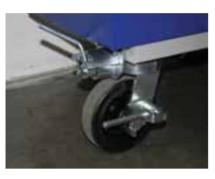
Rear Wheel System with release and brake.

8.5 or 12.5-in dispenser, and 1-inch increments allow you to "dial-in" the bead drop rate