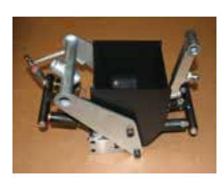
FlexDie—Steel die built to last!